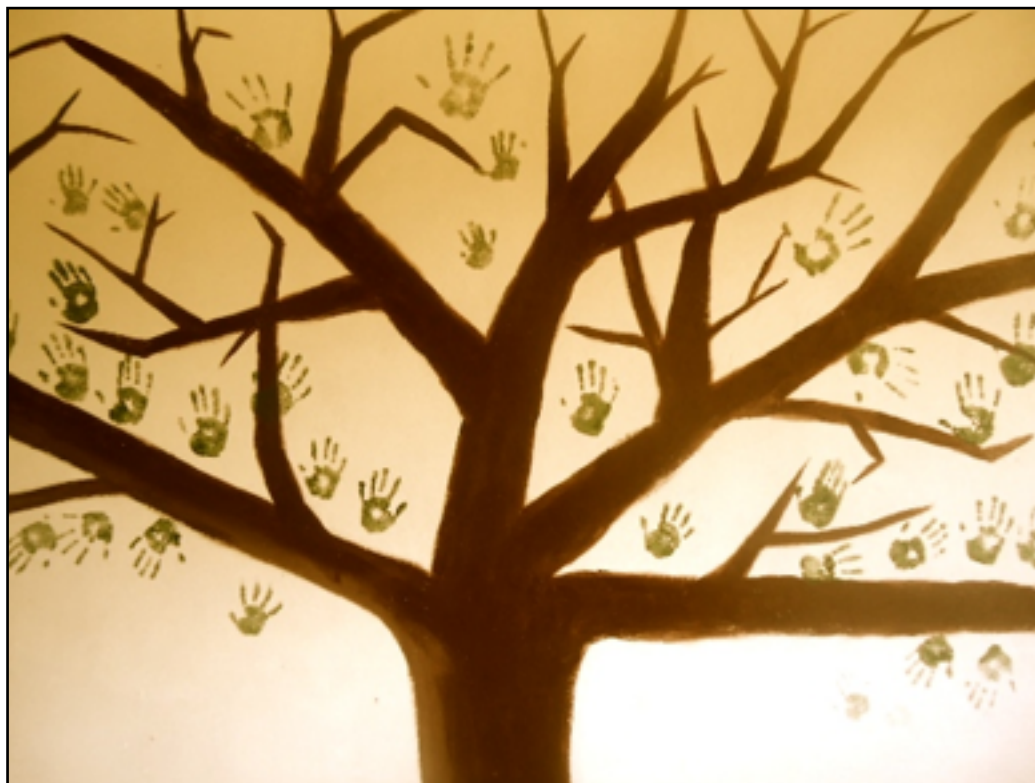
One of the 5 wall murals painted at the elementary school in Mamelodi,. This one came with a lesson about caring hands to the 60 school children who left their hand prints.