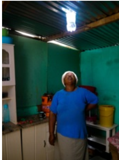
Waka Waka lights were given to 70 secondary school children to ensure a safe way for them to do their homework at night.